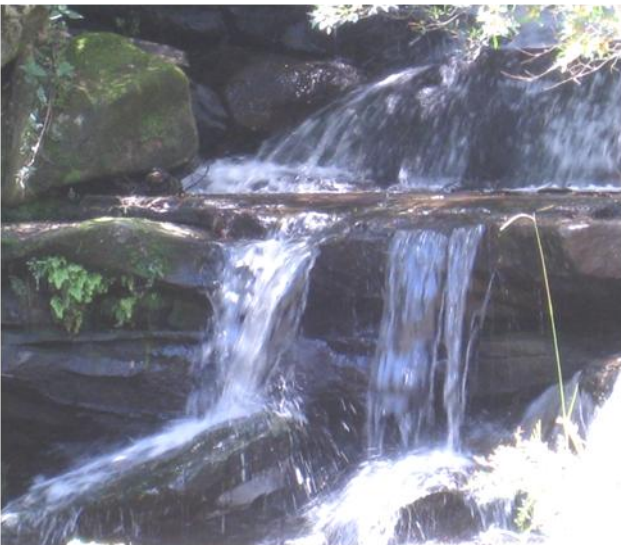
Part of the 'Falls'

A great day with perfect weather and a nice turn out of members, although not a lot of veterans. This could have been because this year it was held on the 1st Saturday of January where we usually have it on the 2nd Saturday, my mistake. Thanks to all that made the effort and attended.