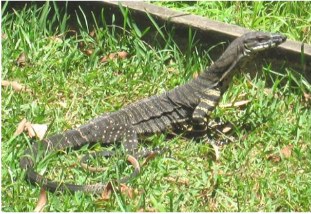
Lunch time visitor