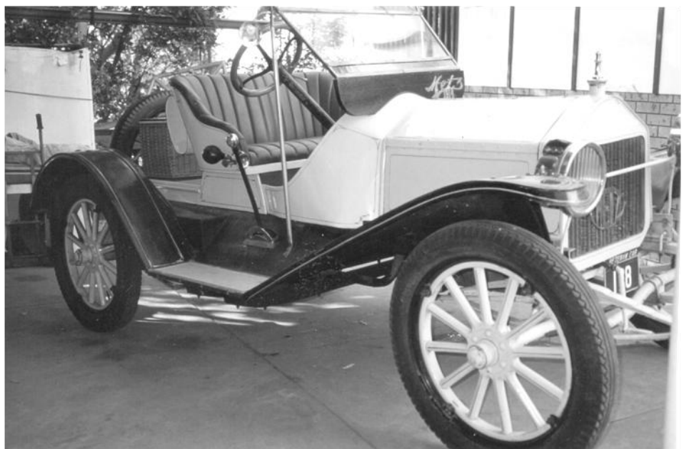
The completed restoration of the Metz

I wonder how many of our early restorations are quietly and sadly rusting away unused.