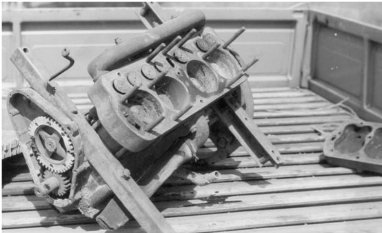
The Metz motor

The original wire wheels were 24" and tyres unobtainable at the time. I acquired a set of good 4.40 x 23" s/side wheels, tyres & tubes and adapted the wheels to the Metz hubs. Photo 6 shows the Metz as completed.