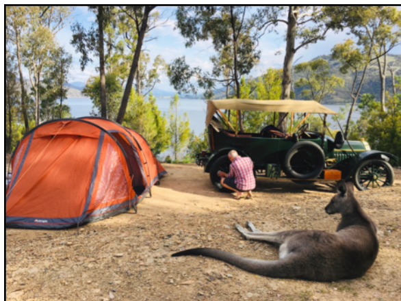
Our picture perfect idyllic campsite at Burrinjuck Dame (and Chris cleaning the diff oil off the wheel!)

and closely observed by a large gang of King Parrots on the scrounge for Weetbix. The two local roos quietly appeared in the shed beside us to sit in their wet fur looking patiently at us with their big brown eyes and doglike faces. They enjoyed their Weetbix too. The rain eased and finally stopped and we took advantage of the break in the weather to pack up, leave the peaceful camp and get moving along the road again.