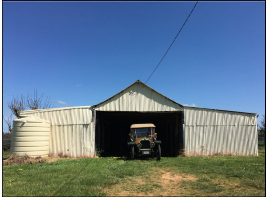
The FN's original garage

The next day, day four, we had planned to find the Eubindal property however, we were now a day in front. So we spent the day motoring around the small villages and discovering the property of Bookham Station, where our other FN2400 originally came from. Interestingly the two FNs were on stations near each other in their youth and eventually they ended up on a third station property together, one cut down to be used as a farm ute and the other (the Eubindal FN) was kept as a spares car before both finally coming to Newcastle. But that's another story!