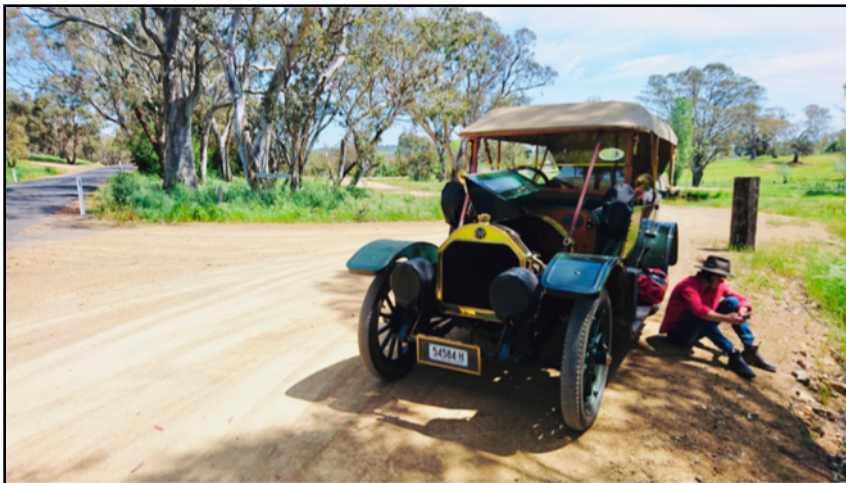
Waiting for the station owner. The FN at Bookham Station, the original home of its identical twin, chassis #296

Beer cooling in the fridge, we went and jumped in the cool waters of the dam as dark rolling thunder clouds rolled in around us and eventually dumped their load, drowning us and the kangaroo. It was a great camp site and one we will go back to.