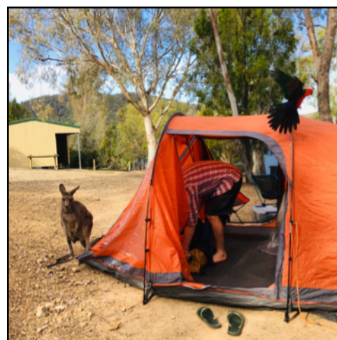
Inquisitive kangaroo and dive bombing King Parrot

comfortably through the farming plains and undulating hillsides back tracking our travels from the day before in order to avoid having to use the fast paced M31 freeway. The FN was humming along nicely. We discovered a quiet road on the map that looked like it was going to be a perfect bypass around the freeway and Yass. In reality, it was a fire track through the eucalypt bush with not more than a couple of rough wheel tracks through the long grass. Lovely! So off we rolled. Unfortunately after the third rocky creek crossing and tight turn we aborted the attempt and turned the car around and returned to the sealed road that we travelled on earlier in the week. It's a very capable and strong car, the 2400 model of FN, and even though we have taken this car over almost all kinds of terrain and landscape, descents and ascents, we are always respectful that it is still an antique vehicle and therefore has limitations, and requires much sympathetic driving, as with all veteran vehicles.