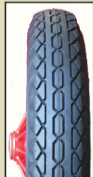
600 X 20"