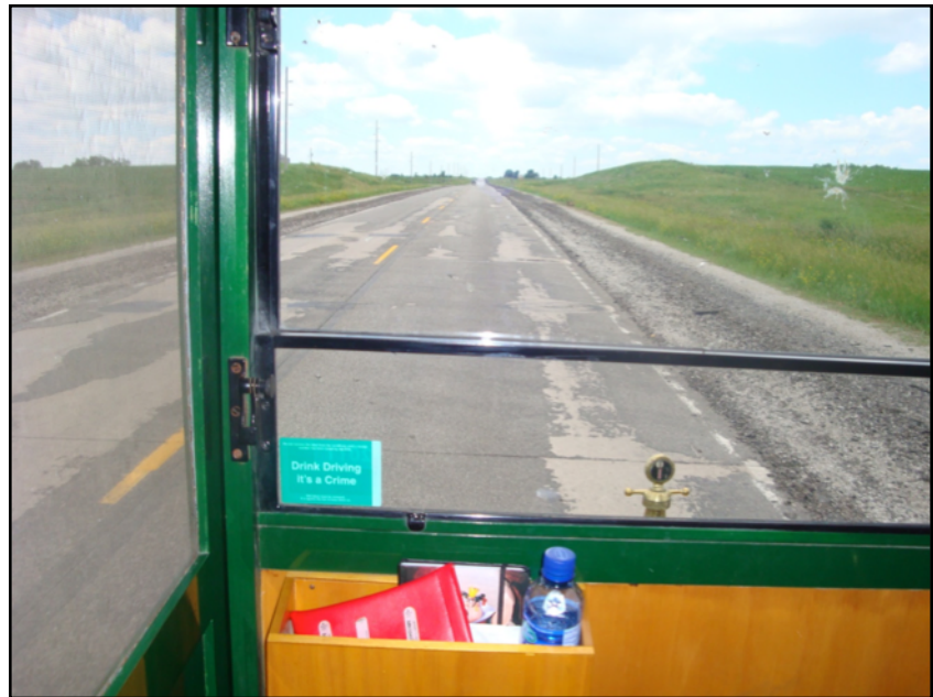
The Lincoln Hwy near Shenandoah Iowa

coast to LA. This enabled us to travel some of the way on the Lincoln Hwy as driving on the normal expressways was not only unnecessary and potentially unsafe but a boring drive as most of the freeways are lined with trees making views of the countryside impossible to see. In most areas old roads such as the Lincoln Hwy follow the same route usually only a few miles away from the main freeways. These roads being the original ones pass through the many small towns some of which have suffered badly due to being bypassed but for others they have prospered without the heavy interstate traffic.