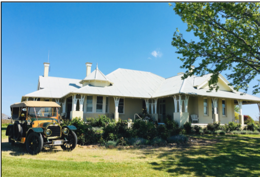
The (1911) FN back home at the (1906) property of Eubindal