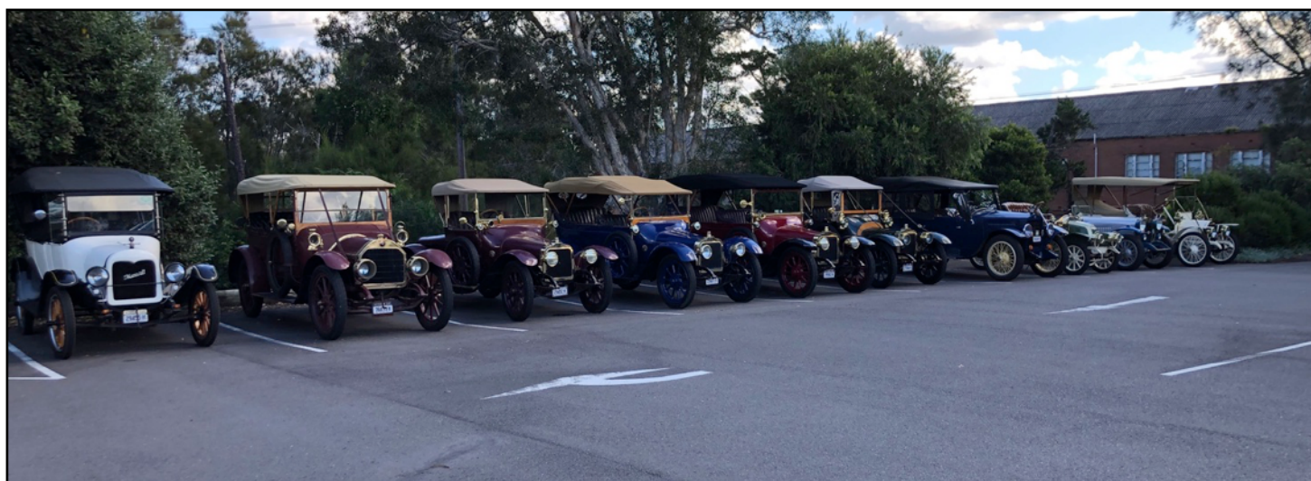
Maxwell, F.N, Talbot, Talbot, Talbot, Talbot, Essex, Renault, Vauxhall, Fiat