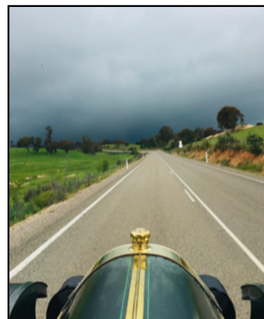
This looks like Veteran motoring fun...

Moving on after lunch, we enjoyed the next bunch of roads and villages just quietly putting along and very much enjoying the perfectly lush green scenery and then after Crookwell with the predicted nasty change in the weather the dark clouds started closing in above us outside of Taralga and things got a little interesting! As we moved nearer and tantalisingly nearer to the dry safety of Taralga, it became very evident that we were just not going to make it. Our route was going to take us right under the developing storm and it was becoming very obvious that we were about to get properly drowned. Thunder rumbled all around and an occasional strike of lightning lit up the dark clouds. We slowed and pulled over to dress in our wet weather gear. We checked the leather straps were tight on the erected hood and that the canvas tonneau cover protecting everything behind the front seat tub back to the back seat was fastened and closed and then climbed back into the warmth of the car and steered out onto the bitumen and into the oncoming storm.