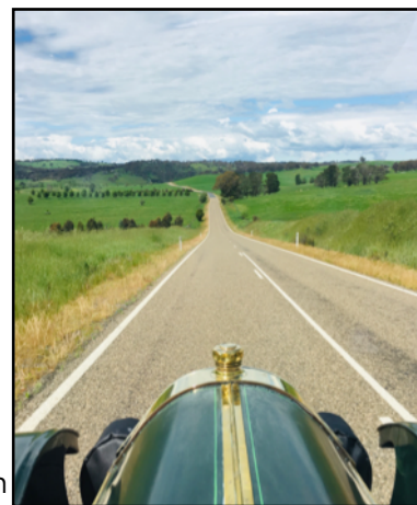
The beautiful drive between Boorowa and Crookwell, just before things got nasty.....

from the back of the FN. All the doors opened and out piled the excited contents and we were suddenly surrounded by half a dozen grey nomads asking their questions loudly and all at once. They had spotted us driving through the town and then followed us until we stopped. All the usual things happened that everyone here who owns a veteran car has experienced before: questions of what is it, where's it from, how old, what's that, how fast, how much, can I blow the horn, etc. before happily satisfied, they all piled back into their vehicles and had a quiet lunch. Then so did we.