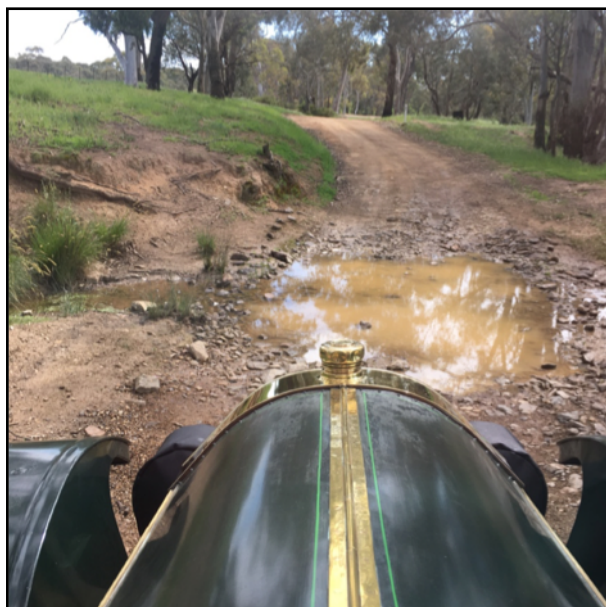
One creek crossing too much!

Escaping, we're sure, from an imminent veteran car catastrophe, we turned back onto the bitumen and began the more sedate driving experience of the Lachlan Valley Way retracing our journey from the middle of the week for the next 178 kilometres. Starting from near Yass we putted along through more crops of bright yellow canola and farming land to Boorowa where we stopped for some lunch in a quiet, secluded grassy park under a big old shady tree. "Great", we thought, "we're hidden". But we were wrong. No sooner had we stopped and flicked off the engine, we had time to get out and pour a cuppa before a massive Winnebago accompanied by a smaller car came heading for us and stopped no less than two metres