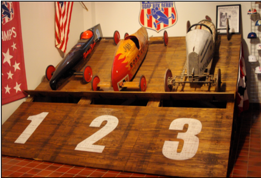
Soap Box derby winners

Sally and I were treated to a private showing or should I say a free for all as we were given free reign by ourselves of the museum before it opened. Normal hours for escorted tours are Mon to Fri 12:30pm to 4:30pm Sat 9:00 to 1:00 but when we can actually fly internationally again who knows? As we were travelling in our Model T we usually got special treatment but doing so always gives you a "Foot in the door" so to speak, people approach you ask about the car, offer to help or just want to take you to lunch so they can check out what has happened on your trip. If we pulled up for a cold drink at a gas station the drink would often be free. We were treated to free accommodation, staying in people's houses or at their properties so we could camp in the Kamper, in one instance an email we received instructed us to go to a location without any hint as to what was there. Thinking it was to meet up for a dinner we found we had been booked into an expensive B&B at a winery worth about 4 nights stay in a motel which had been paid for by someone we had never met.