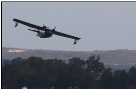
Flying boat

Our day started by gathering at the restoration site at Kilaben Bay. After a short introductory talk from the Rathmines Catalina Association President, we were treated to a splendid $5 per head morning tea. We then split into two groups and were given a tour of the site, and some history of the plane they are restoring.