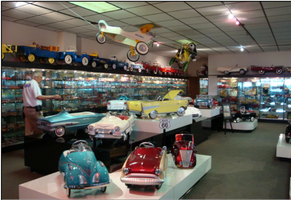
Part of the Pedal car area

Large numbers of the cars are historical winners of races such as those from the Indianapolis Speedway. What you won't want to miss is the displays such as the pedal cars, examples of which one has no