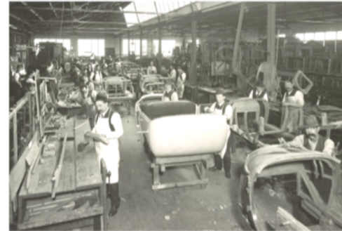
eg the “Isis Downs” 1909 Mercedes, the “Horden Ghost” 1913 Silver Ghost, the “Harris Tea” 1914 Benz, and 100’s of other heritage vehicles, from the ordinary to the spectacular