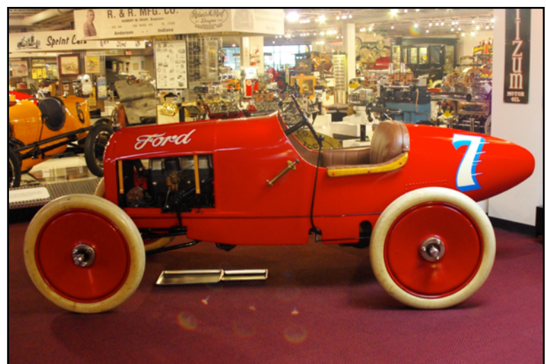
A Model T Ford Speedster