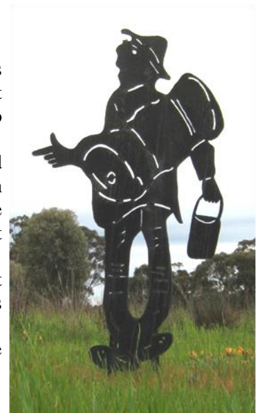
Sculpture at Lockhart

The group walked to the Commercial Hotel for our evening meal, very nice with a log fire burning. A nice day for travelling but a little cool at times.