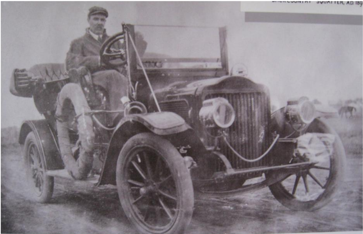
What breed of car is this? Answers to the Editor