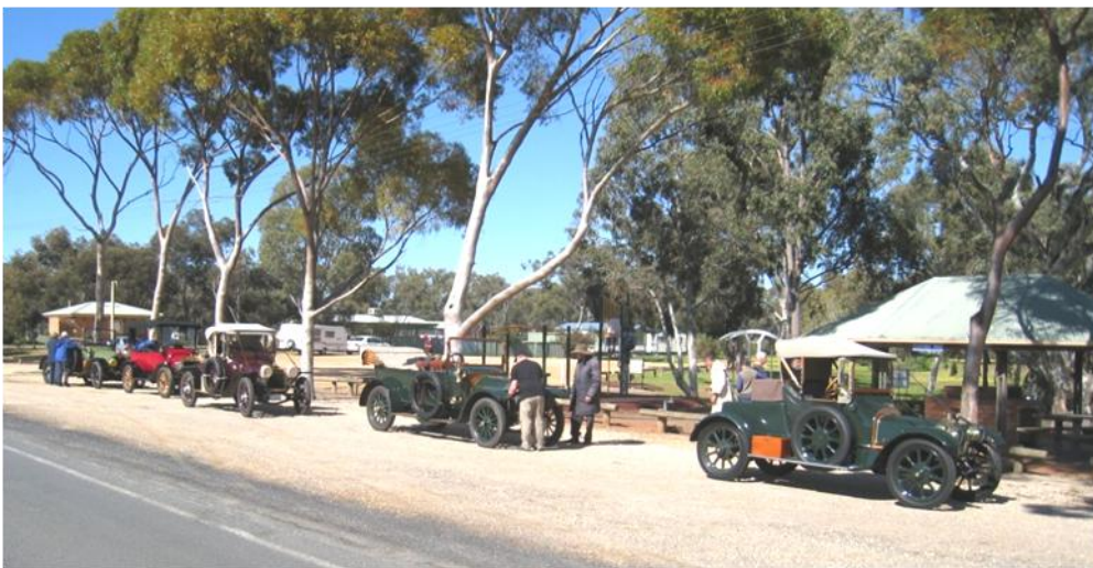
Morning tea stop at Uran. Crossley, Ford T, Talbot (Kevin's), F.N. & Talbot.

A much clearer morning still a bit of cloud about but no cold wind. Filled with fuel before leaving town. A nice drive across to Urana for our morning tea stop in the picnic area beside the Aquatic Centre Lake. Saw a few emus on the trip across.