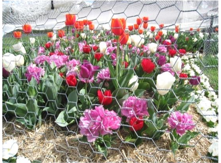
Tulips in the park at Mittagong

We then continued along Camden Valley Way to Camden, a lot of road works being done in this section. Up over Razorback to Picton, on through Bargo, Yerrinbool, to Mittagong for our lunch stop in the park near the railway station. A nice display of tulips in the park.