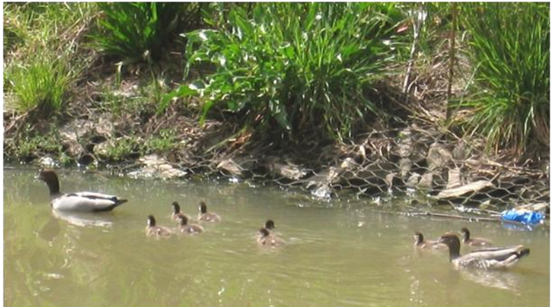
A family of ducks enjoying a swim in the Muttama Creek.

Again the group went to the hotel for their evening meal.