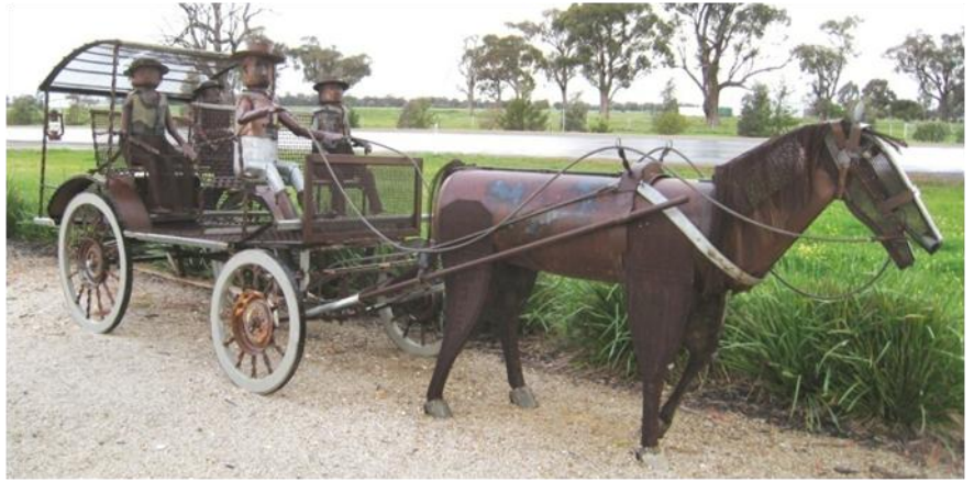
Sculpture in the park opposite the Lockhart Motel depicting life on Brookong Station

The group walked to the RSL for our evening meal and a light drizzle on our walk back. It had been raining heavy while we were having our meal as the gutters were flowing a fair bit when we came out.