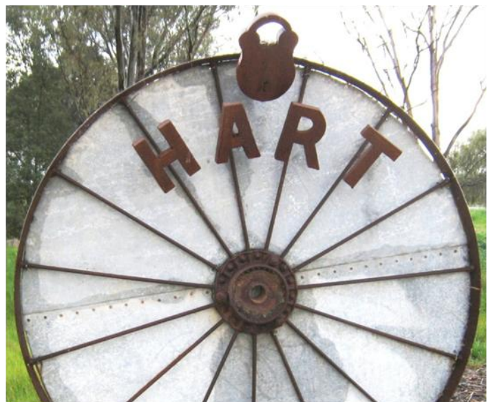
Sculpture in the park opposite the Lockhart Motel

On through Yatheila, the outskirts of Wagga Wagga and along the Sturt highway to Collingullie, only to find you can no longer buy fuel there.