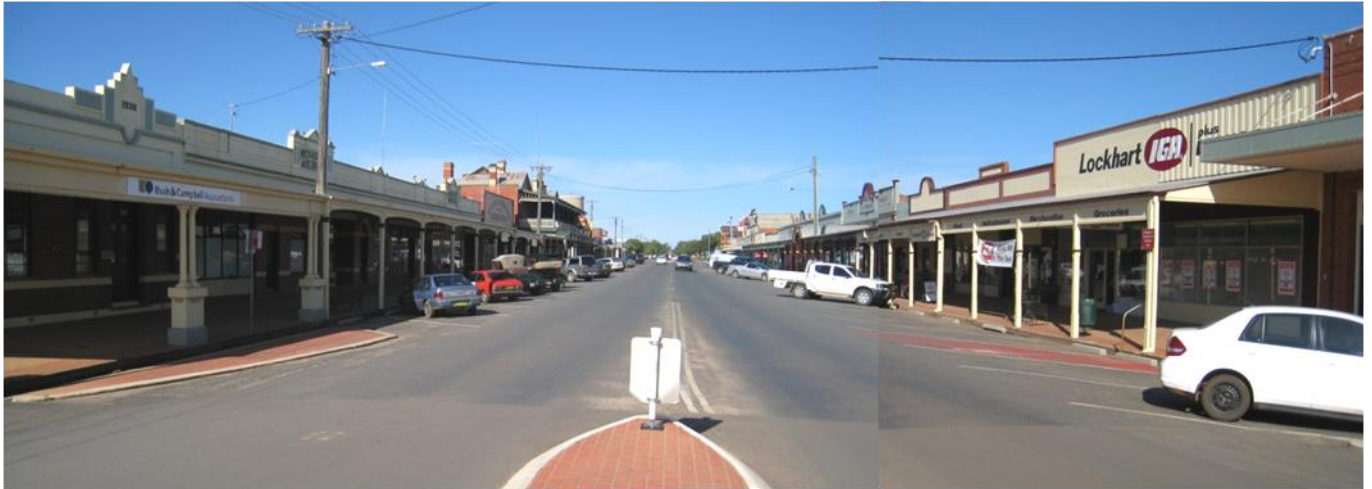
The main street of Lockhart - "The verandah Town"

Lockhart is situated about in the centre of the original Brookong Station property, in 1845 when the run was first taken up it covered some 480,000 acres. From 1894, the gradual breaking up of Brookong was pre-empted by government resumption of expired leases, taxes on unimproved land and closer settlement legislation. Apart from two acres, the remaining land had been sold to smaller farms by 1926. The Brookong Homestead is about 16 kms S.W. of Lockhart on the Urana Road.