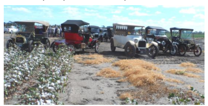
Cars at cotton field

I plan to go to the next leg of their four stage 60<sup>th</sup> Anniversary Rally at Yamba in May.