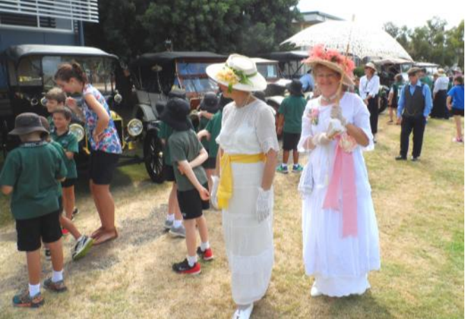
Old Ladies at school visit