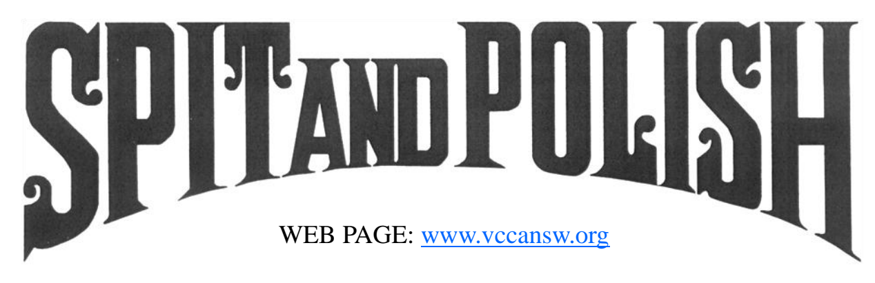
TABLE OF CONTENTS - April 2016