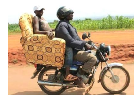
"Comfort at all times"