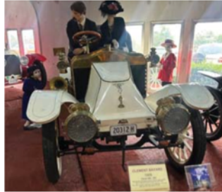
1909 CLEMENT BAYARD. Four cylinder Touring car. #7452 $69,000