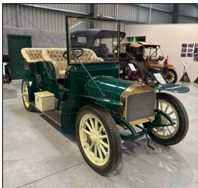
1906 Brown - Roger Mahan Heritage Centre