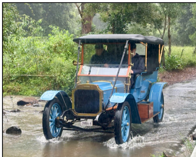
Above L-R: 1914 Wolseley, 1913 Talbot, 1910 SCAT