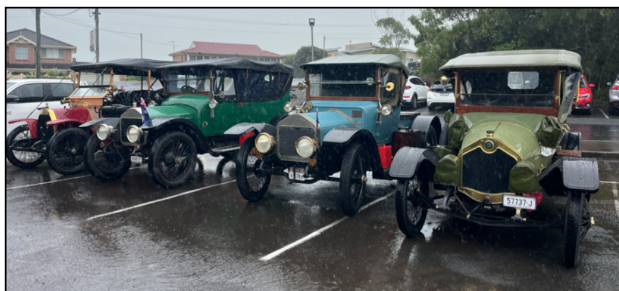
SCAT, Wolseley, Wolseley & Crossley

From Coolangatta Estate the route took us for a loop through Shoalhaven Heads, back along Bolong Road towards Nowra past Coolangatta Estate. At this point there was a very brief pause in the rain, and