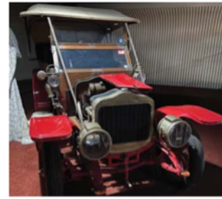
1905 MINERVA. Big impressive T head four cylinder touring car. #7451 $195,000

SOLD 1913 Crane Simplex - Original unrestored. $POA