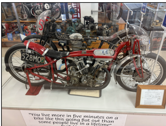
Worlds Fastest Indian - E Hayes Motorworks Collection