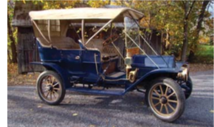
1909 CADILLAC. Touring, new upholstery, engine recently refreshed, correct lights, good runner, 1st stand alone year for the 30hp four cylinder Cadillac. #7442 $90,000

Reconstructing Australian motoring history - one car at a time