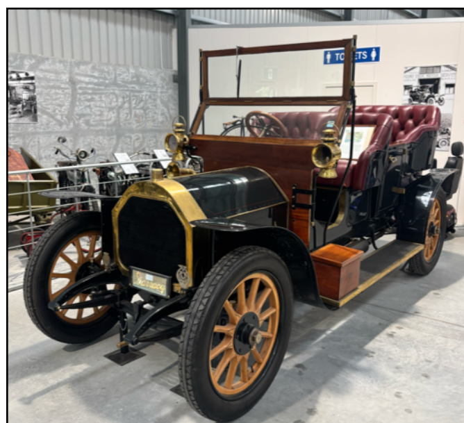
1908 Darracq - Roger Mahan Heritage Centre