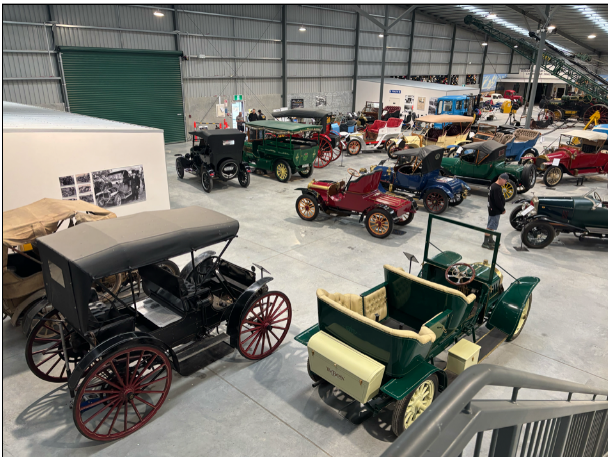
Roger Mahan Heritage Centre (part)