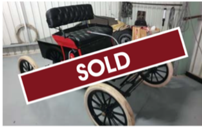
1903 CURVED DASH OLDS. Older restoration, very original and correct, excellent entrant for the Per '05 Tour or the prestigious London to Brighton Run. #7450 $70,000