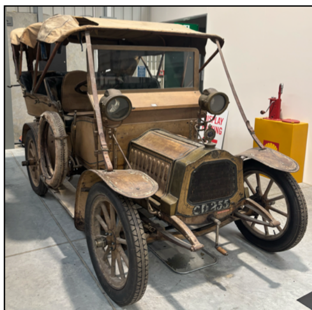
1907 De Dion - Roger Mahan Heritage Centre