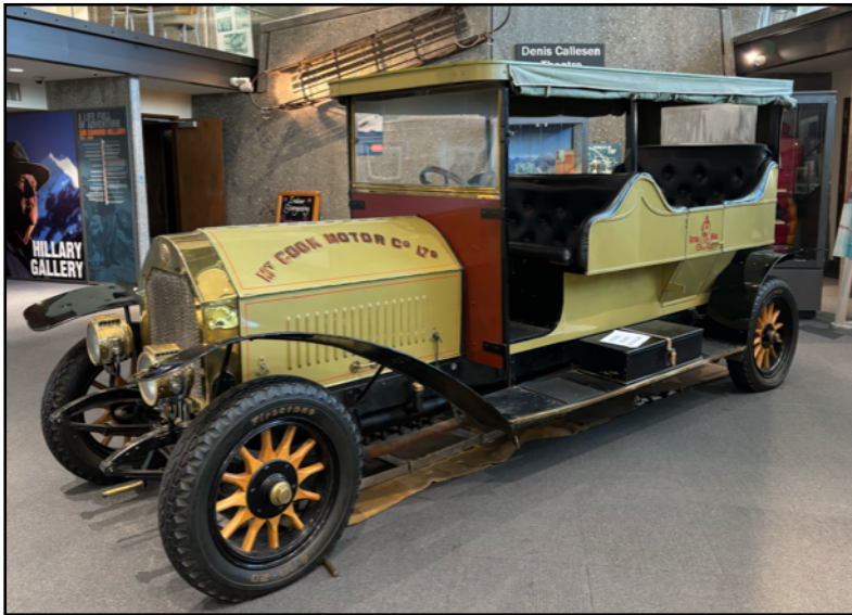
1908 Darracq 60HP- Mt Cook One of the original cars in the Mt Cook Motor Service.

With world class driving roads, breathtaking scenery, and a Kiwi approach to work/life balance, we intend to experience Veteran Motoring on the South island sometime in the future.