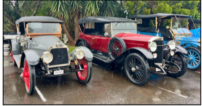
Talbot, Benz, Vauxhall

After lunch at Club Callala, the route then took us back towards Nowra past some very scenic dairy farmland, across the Shoalhaven River and back towards Shoalhaven Heads.