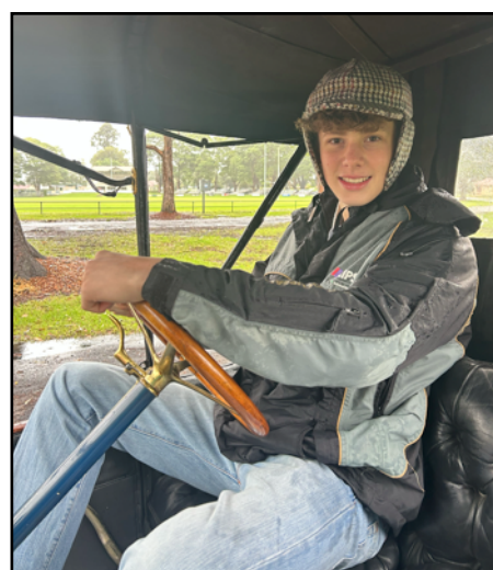
Hopefully our newest entrant for next years event?

There were horrendous winds and rain throughout Saturday night, thankfully with no damage to any cars. However it did mean that there were a few cranky cars in the morning who decided they were too wet to start. As a result the Benz and the Wolseley Roadster were the only two Veterans to venture out on Sunday.