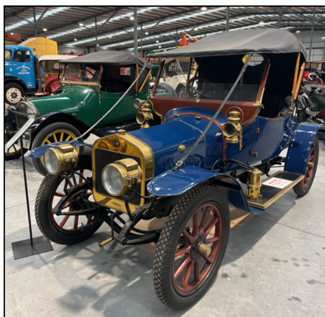
1910 Delage - Roger Mahan Heritage Centre